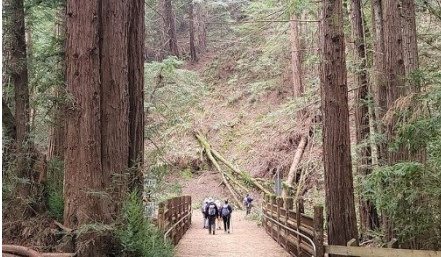
Fallen trees - Rita Poppenk; Ladybugs - Teresa Schwanauer; Group, Stream Trail Bridge, Stream Trail - Sylvia Kwan