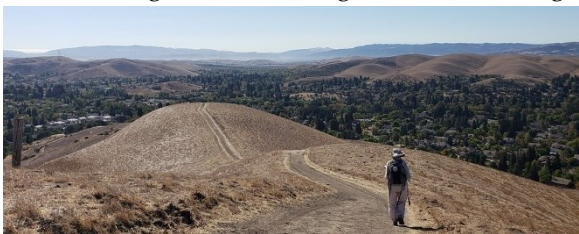
Header: Private vineyard, Sand Hill Trail, view from Short Ridge Trail, Old Blackhawk Road

After a mile and a steep downhill, we continued out onto the local streets of Danville viewing some beautiful large homes and yards until we got back into the park entrance and headed up to the Sand Hill Trail and back down the hill to the park.