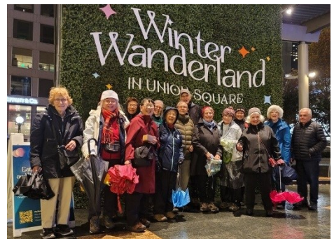
Umbrellas out on Embarcadero, Pier 39 tree, CCHC at Union Square, SF Glow building ; Festive lanterns on Chinatown street