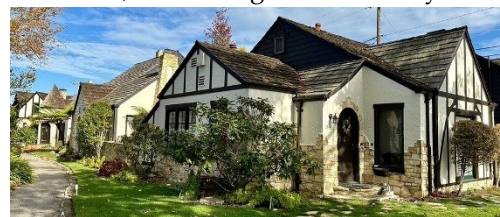
Victorian, Tudor, French-style home -Laurie Lau

work; Victorian homes characterized by ornate gables, bay windows, decorative woodwork; English cottages characterized by wood beams, gabled roofs, leaded-glass windows, beautiful gardens. Oh my! At Broadway we