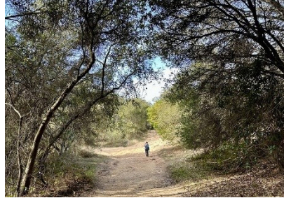
From Canyon Meadows hike: Fall Color & Sole Hiker on Stream Trail—Laurie Lau