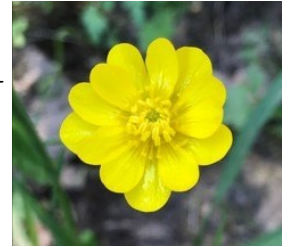
Mt. Diablo Globe Lily, Virgin's Bower & Buttercup