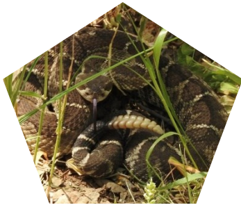
Cal. Quail, Rattlesnake!, Chinese Houses, Wind poppy - Noël Siver

Starting at Regency Trailhead (parking on El Molino) in Clayton, we hiked a bit more than 5 mi. by