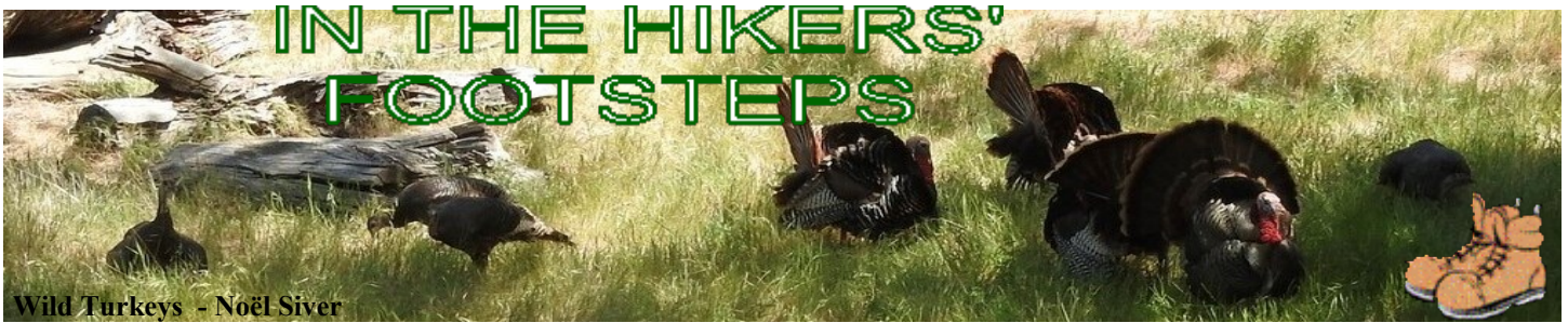
Wild Turkeys - Noël Siver