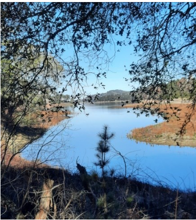
First sight of Reservoir from trail, Lone Pelican on the water - Rosemary Johnson

gasp startled the animal into diving into the water. The roundtrip was approx. 3.6 miles.