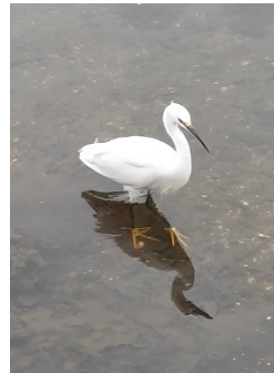
Snowy egret's "golden slippers" visible—they shake these to lure prey