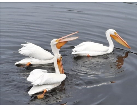
Pelican in back is swallowing his recent catch