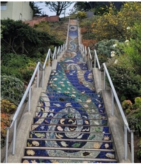
16th Ave Stairs - Sylvia Kwan

climbed the wooden steps to Grandview Park for splendid views of the Sunset and north. The neighbors call this park Turtle Hill. The rocks that make up this hill are Franciscan Chert from the sea floor. We enjoyed another set of tile steps, the 16th Avenue Hidden Garden Stairway, looking back at the colorful tiles.