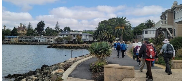
View of Benicia beach access and Carquinez hills, Poseidon's Daughter, Bay Trail - Sylvia Kwan