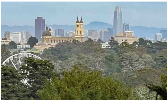
View of park Ferris Wheel and Cityscape, Colorful flora. Child's bird ID sign - Teresa Schwanauer; Hutchinson Falls at Stow Lake - Sylvia Kwan